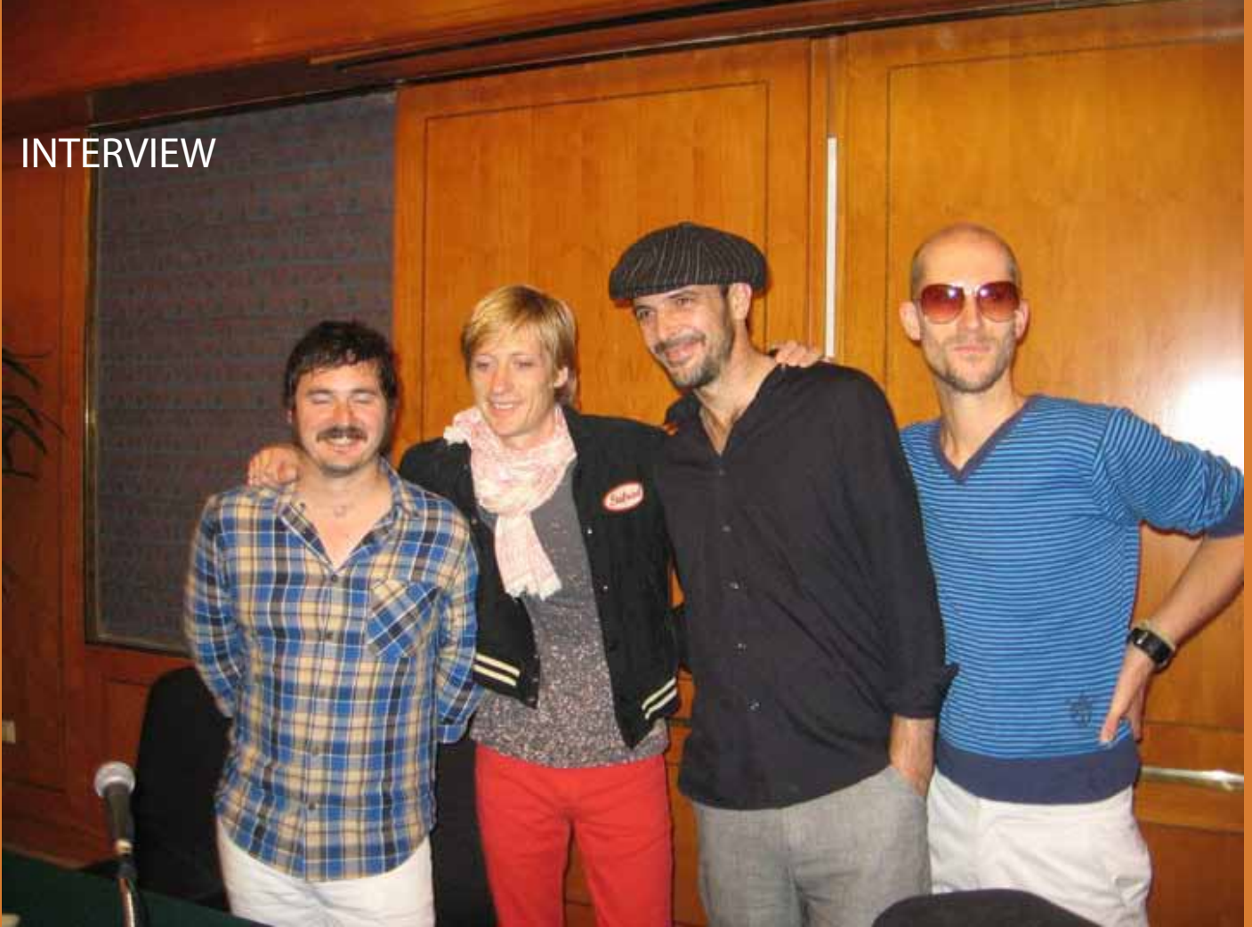
KULA SHAKER, THE SULTAN HOTEL, JAKARTA, 6TH AUGUST 2010